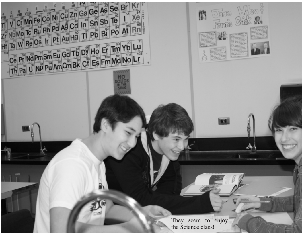
They seem to enjoy the Science class!