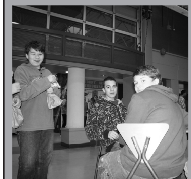
Lunch time: a moment of sharing anything with everybody