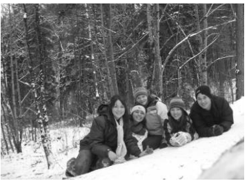
Snowday: what happens when school is closed!